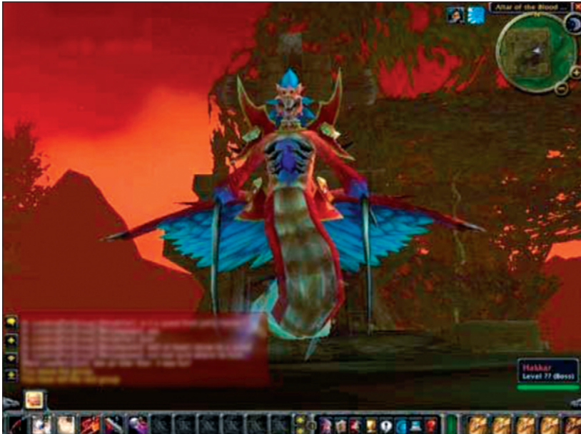
Figure 2: Hakkar, the primary source of infection in World of Warcraft

game, keeping them in stasis until they can be healed or otherwise safeguarded after the dangers of combat have gone. These pets, therefore, acted as carriers of the disease and also served as a source of disease by causing new outbreaks when brought out of stasis—even if their owner had recovered and was no longer infectious. Based on player accounts, pets, as opposed to the infective characters themselves, seem to have been the dominant vectors for the disease. Players would return to densely