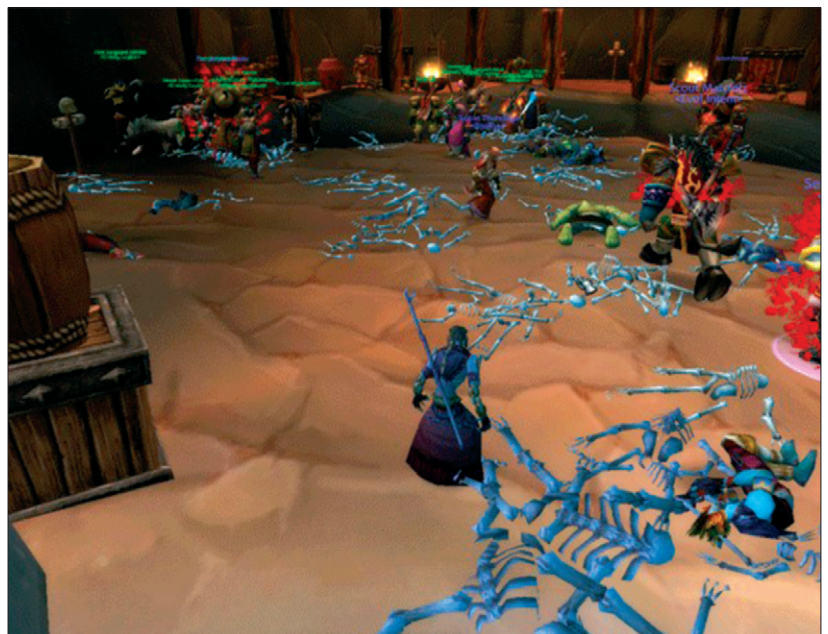
Figure 1: Urban centre in World of Warcraft during the epidemic

For more information on World of Warcraft see http://worldofwarcraft.com See Online for webfigure